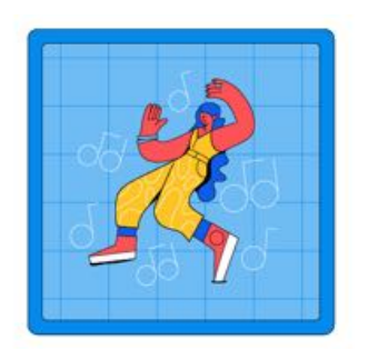
DANCE IT OUT

Research shows that touch between a human and a dog can have therapeutic benefits for both species. In humans petting a dog can trigger the release of oxytocin, lower your heart rate and reduce blood pressure.